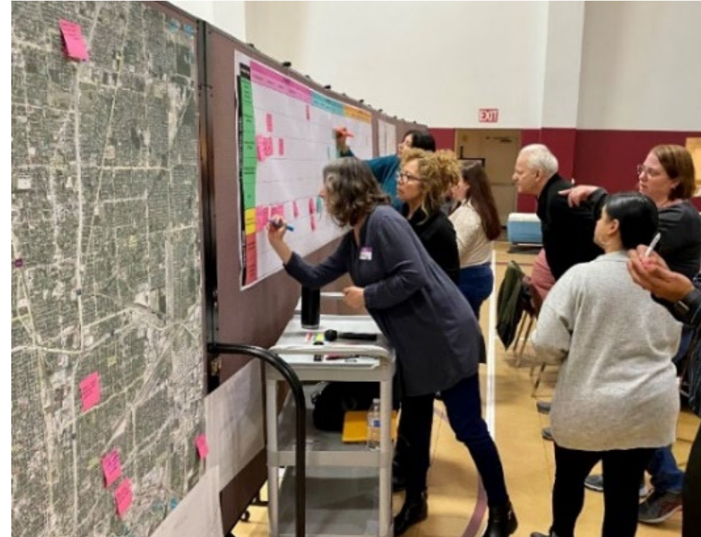
Work is already underway in Houston, where groups met in February to share their visions and build a collaboration.